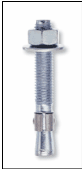
Trubolt Wedge Anchor