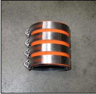
Husky® 4 Clamp Coupling (80 in-lb)