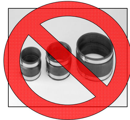
Joints® Calder Coupling