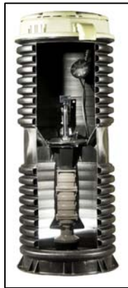
E-One® Model D-H071

Complete packages are required for Pre-Approved Pump Systems. This includes a pump, alarm panel, isolation and check valves, sump and sump extensions (as required). Individual parts of Pump System are not pre-approved by CCCSD. Models include but are not limited to the ones below, contact CCCSD for special approval of all others.