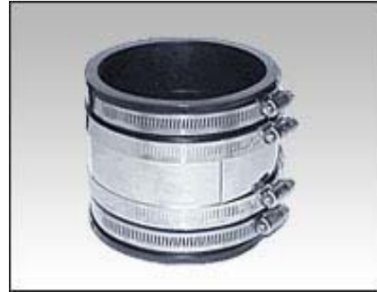
Fernco® Stainless Steel Shear Rings (60 in-lb)