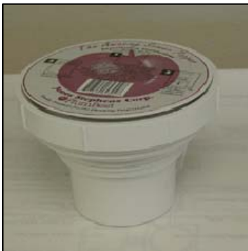
Sewer Popper™ OPD