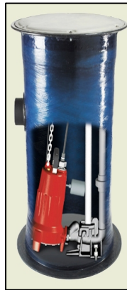
Liberty® 2448 Series