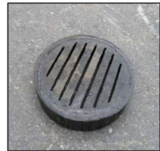
Christy® V1-71C Grate