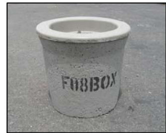
Christy® F8 Box