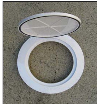
Sewer Relief Cap