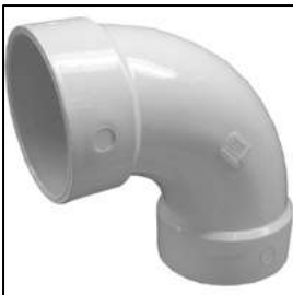
90° Sweep Elbow for pressure side sewers