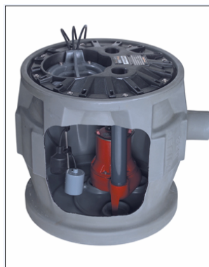
Liberty® Pro380 Series (2" discharge system, Required Access Riser)