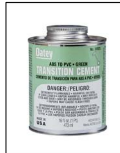
Oatey® ABS-PVC Cement