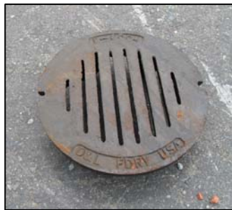
Christy® K-6004 Grate (Special Order)