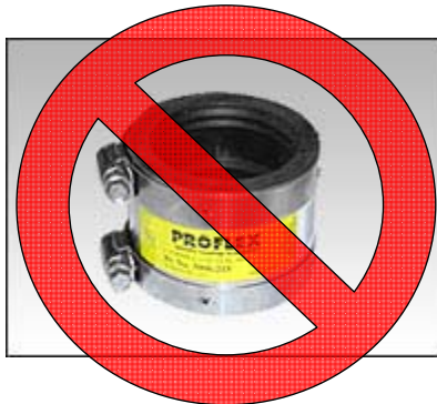
Fernco® Proflex Coupling