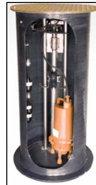
Aqua Pro SG-1182-2