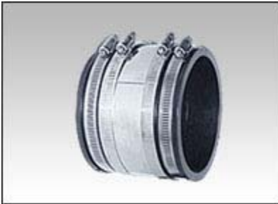
Fernco® Strong Back RC Couplings (60 in-lb)