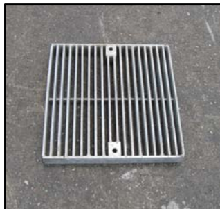
Christy® V12-71W Welded Grate