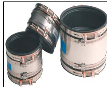
Mission® Adjustable Repair Coupling