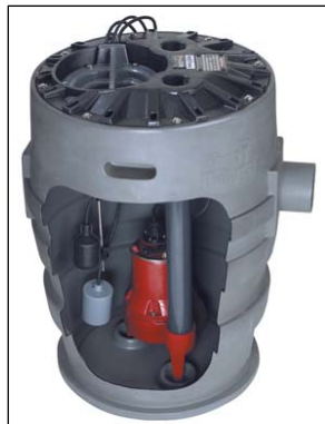
Liberty® Pro370-Series (2" discharge system, Required Access Riser)