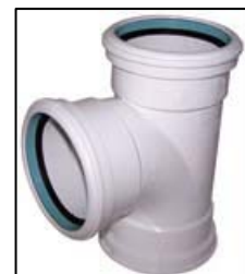
Wye, Tee Fitting