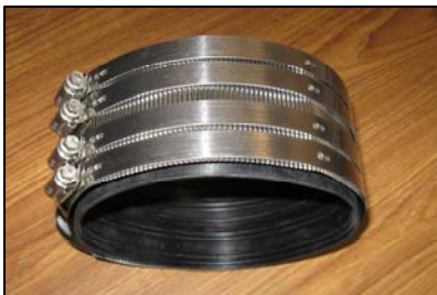
Anaco No Hub (60 in-lb)