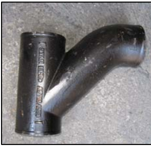
Combination Wye and (1/8) Bend