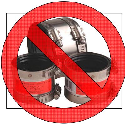
Mission® Band Seal

Note: Check with Inspector prior to purchase of material to insure proper coupling is selected for the different pipe types encountered.