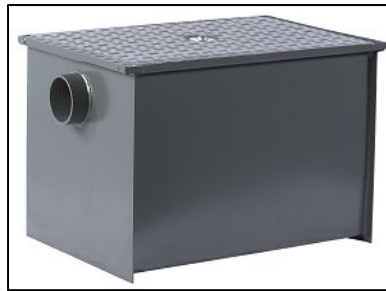
Dormont WD Series