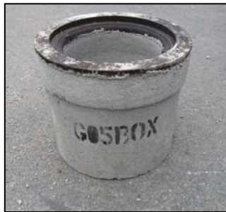
Christy® G5 Box