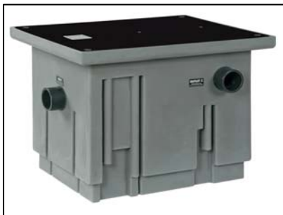
Schier Products Trapper II* PATG-2025 or PATG-2420