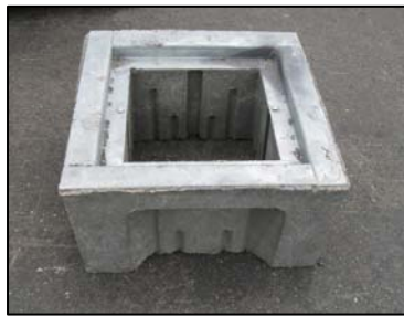
Christy® V12 Box