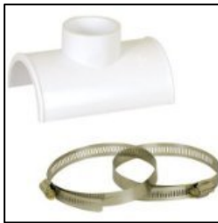
Saddle Tee Fitting