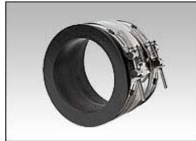
Fernco® 5000 Series RC Couplings (60 in-lb)