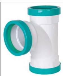
SDR 26 Heavy Wall Gasketed Sewer Fitting