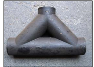
Two Way Combination (Clean Out Only)