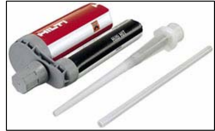
HIT HY150 Adhesive Anchor