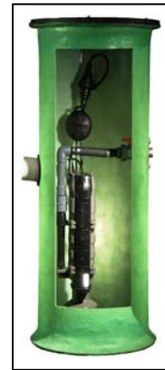
E-One® Model Gator Grinder