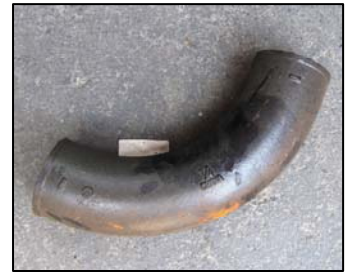
Long Sweep Quarter Bend