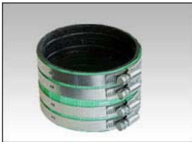
Fernco® No-Hub Couplings Silver (60 in-lb) Yellow & Green (80 in-lb)