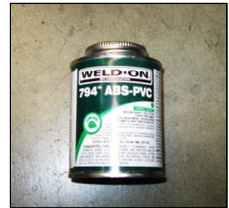
Weld-On® ABS-PVC Cement